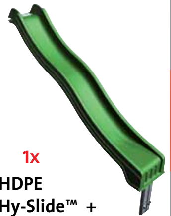
1x HDPE Hy-Slide™ + mounting hardware & anchoring