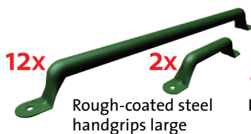
12x Rough-coated steel handgrips large 2x Rough-coated steel handgrips small